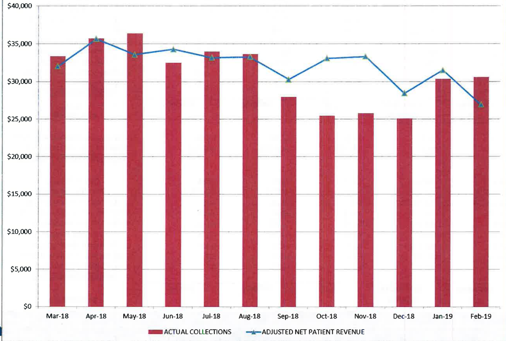
Cash Collections vs. Adjusted Net Patient Revenue